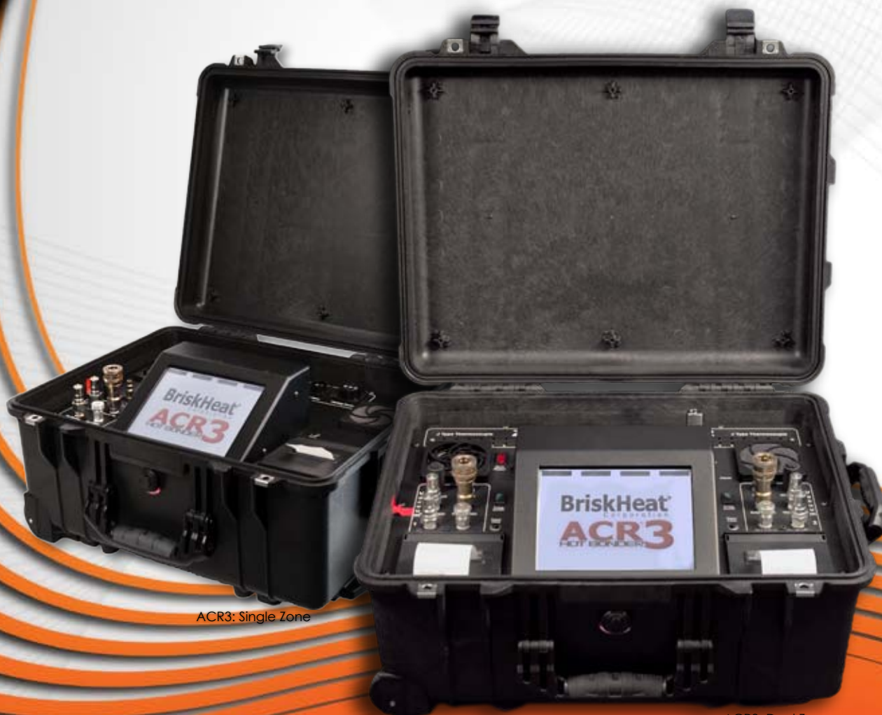
ACR3: Single Zone