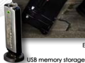
USB memory storage