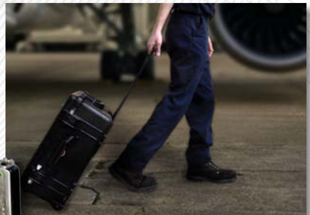
Easy to transport