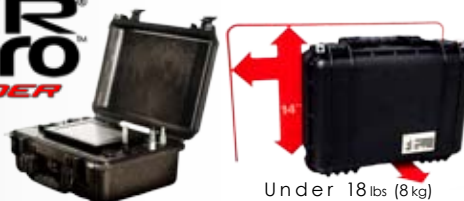
Under 18 lbs (8 kg)