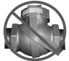
(B) Incorrect Installation: Heating tape overlapped on itself