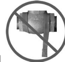
(A) Incorrect Installation: Heating tape hanging free from the surface